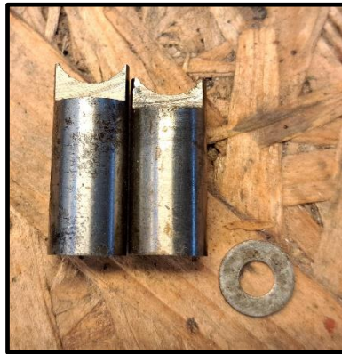
Left: long version (65-2580), right: short version with washer (66-2579 and 1-4621).

Machines built after this used Part No. 65-2580 and the washer was deleted. The difference between the two pins is a length difference of approx .050".