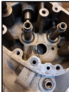
66-2579 fitted with 1-4621.