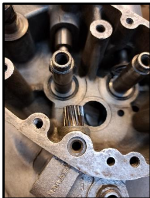
66-2579 fitted without 1-4621.

From the outer end of the 'short' pin to the shoulder where it is reduced to engage the pump drive shaft is approx. .800" and this must be fitted with the washer to ensure correct engagement. The longer, later, pin measures approx. .850" between the same two points.