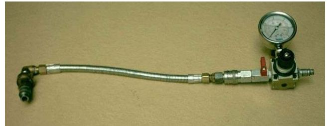
The complete tester

part that screws in the cylinder head, and the part that is fixed to the hose. The pictures give an idea how I did this; I am not sure if the garden hose connection I used is available outside the Netherlands, so you will have to improvise!