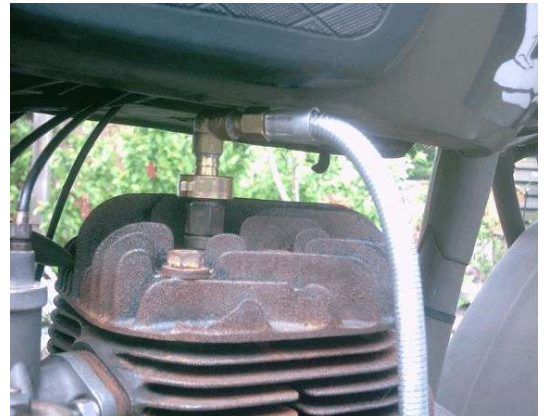
The adapter in place

It is important that after the valve there is somewhere a damper (constriction) in the hose, with a small hole ( 1 - 1.5 mm), so that the air pressure cannot build up too quickly.